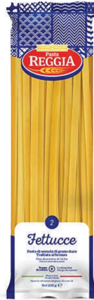
Fettucce Pasta 500g