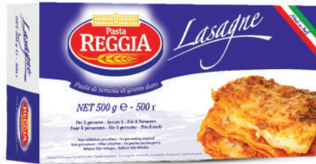
Lasagne Pasta 500g