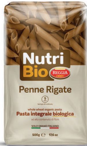
Penne Rigate 500g