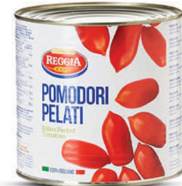
Italian Peeled Tomatoes 2500g

Layer up the flavor with our classic Lasagne Pasta—perfect for rich, oven-baked dishes. Firm, flat sheets hold sauces beautifully for hearty, satisfying meals every time. Long, ribbon-like strands of Fettucce Pasta are ideal for creamy and meaty sauces.