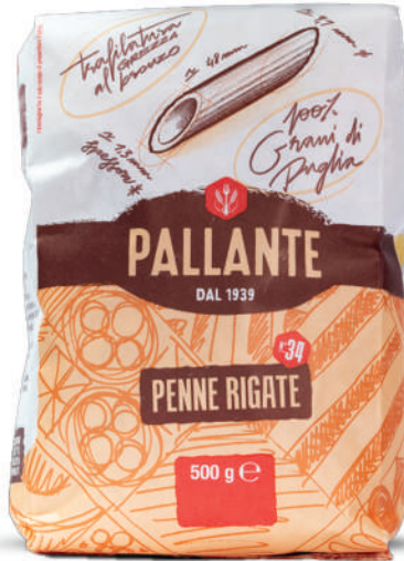
Penne Rigate 500g